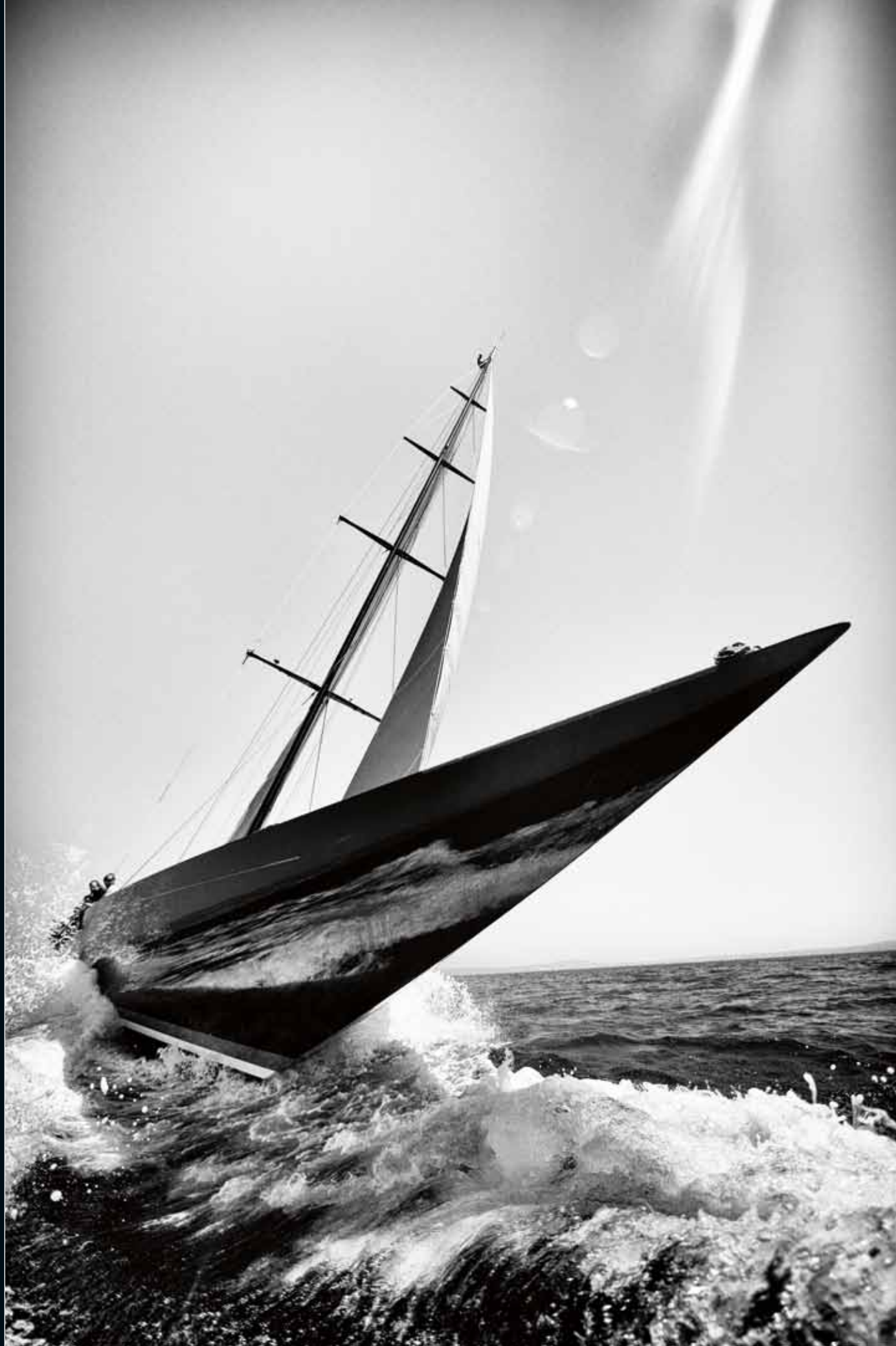
The yacht was intended for fast sailing (right and opposite left). Her interiors (opposite right and opposite top) were designed for practicality rather than luxury cruising

basics such as hull lines, sail plan and cockpit layouts will be the same. 'But within that box there are opportunities to make changes,' says Kieft, 'such as a lifting keel to access shallow harbours – the design of which would not give a different performance – or a fitted-out interior.'