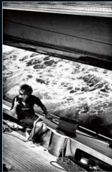
Firefly ’s owner was instrumental in the design of the yacht’s deck layout, which he wanted to be both practical and aesthetically pleasing. She has a yellow cedar deck (above) and all deck gear, winches and custom aluminium fittings are anodised in grey (left and above left). She provided our reporter with a short burst of great upwind sailing (opposite)